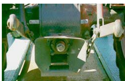
Figure 2: Tapered masterguard