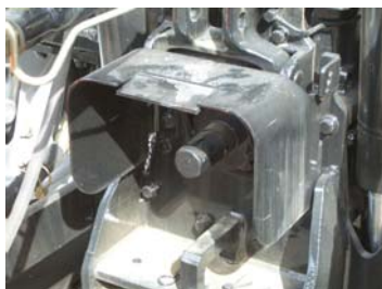
Figure 1: Square masterguard

The masterguard must be able to withstand a force of 1200N, (1200N = 122kg = 270lb = 19 stone) so ensure the steel plate is adequate. Steel sheets such as “tin” (thin gal steel), is not strong enough. Make sure that you copy one that has similar PTO diameter and torque rating, as the requirements are slightly different depending on this. It is obviously easier to bend up a square guard such as in Figure 1 below, rather than the tapered guard type in Figure 2. It is worth looking into incorporating a pre-sprung hinge arrangement such as in Figure 3, if some implements require greater access.